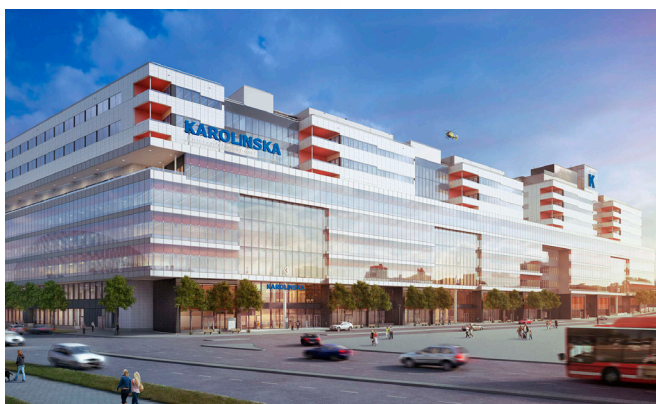
Nya Karolinska Solna, illustration: White Tengbom Team

Swecare identifies mutual areas of cooperation in which the parties enrich each other to create an increase in competitiveness and export value.